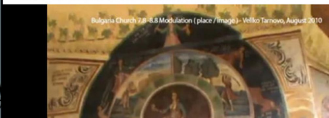
Bulgaria Church 7.8 - 8.8 Modulation ( place / image ) - Veliko Tarnovo, August 2010