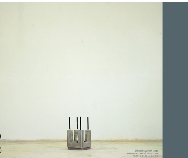
INFRAESCURTA 2010 concrete, metal furniture 0,45 x 0,45 x 0,55 m

Free entrance, by appointment, 18.00 - 21.00 on wednesday, friday and saturday Without invitation, entrance fee 15 RON / person Free entrance for children under 14